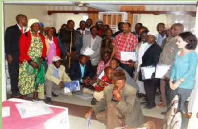
Community members who participated in the capacity building training

Stage 2: Capacity building training of the community members on the BCP Process and development