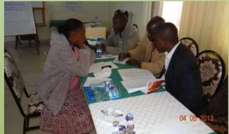
Drafting team during discussion groups