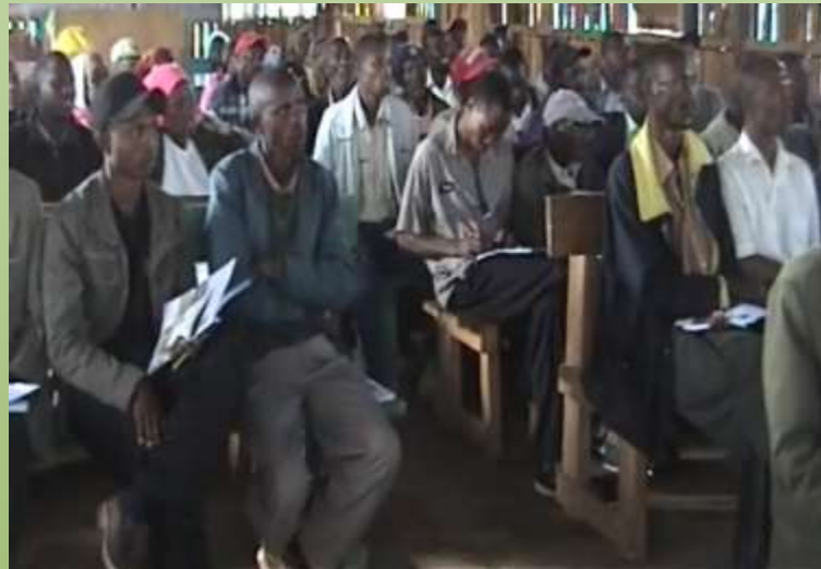
Community Consultation meeting

Stage 1: It involved community consultations through FPIC in different parts of Mau Forest Complex.