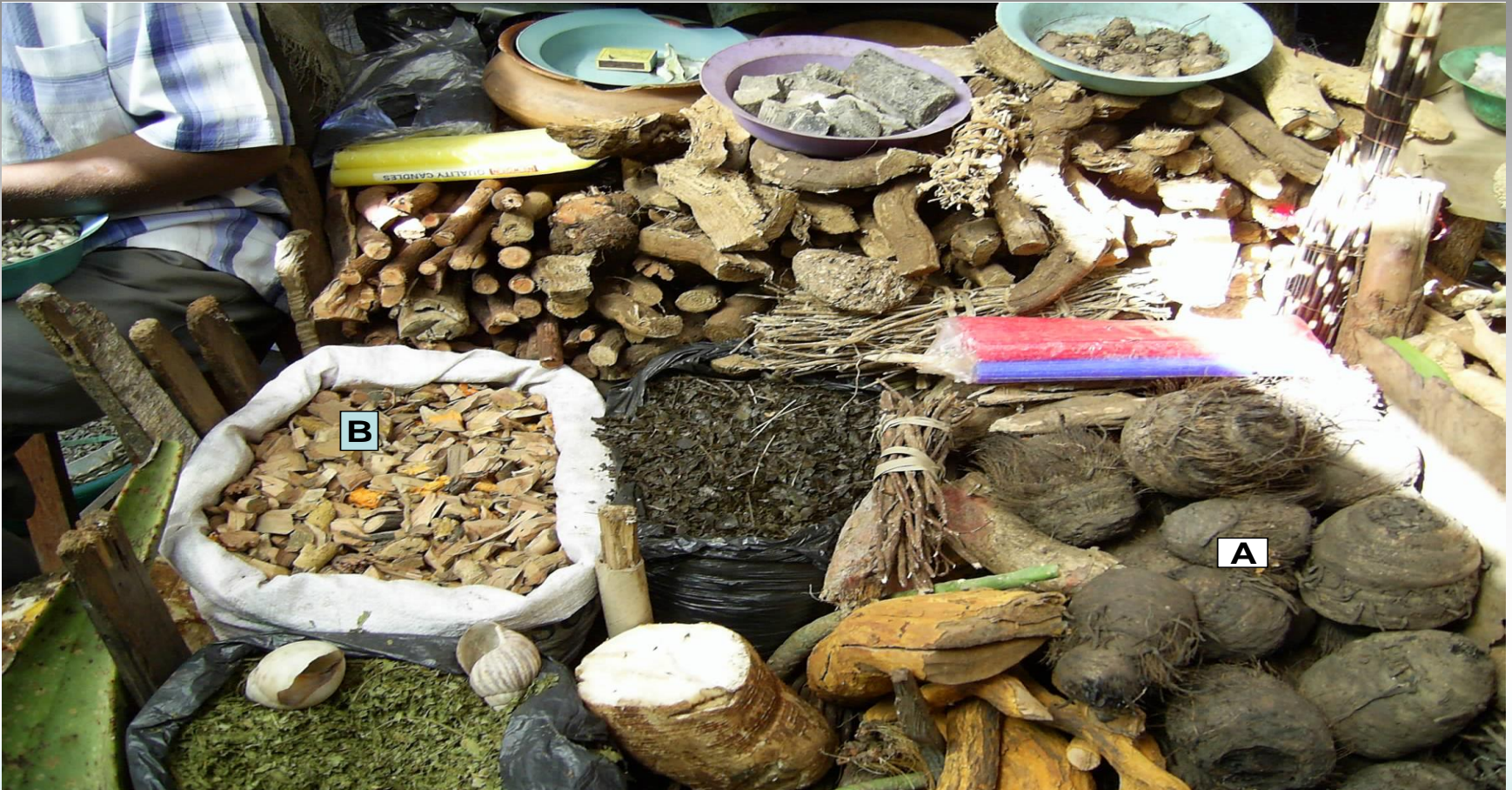
A. Hipoxis hemerocallidea (Bata africana) B. Mistura de medicamentos de epilepsia (Mercado de Xiquelene)